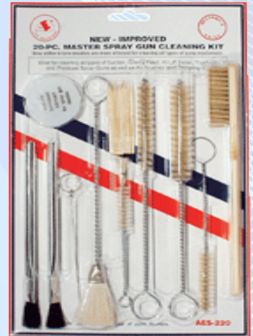
AES220 Master Spray Gun Cleaning Kit—20 piece $10.41