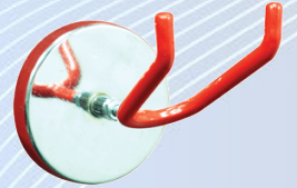
AES165 Magnetic Gun Holder $10.41

Inventory on gun washers is limited, so please allow 10 days for delivery.