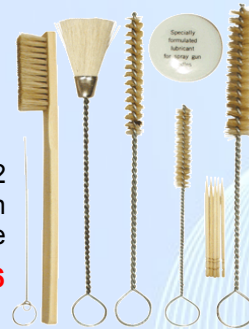
AES212 Master Spray Gun Cleaning Kit—12 piece $8.66

This sales flyer is prepared in advance. Quantities of some items may be limited due to demand. Designated prices are effective only for the term stated in the flyer and for quantities currently in inventory. Graphics are for illustrative purposes only. We are not responsible for misprints, or errors in prices, descriptions and/or illustrations.